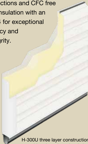
H-300U three layer construction with polyurethane insulation

H-300U doors offer 1-3/4" thick two sided steel ribbed sections and CFC free polyurethane insulation with an R value of 16.4 for exceptional energy efficiency and structural integrity.